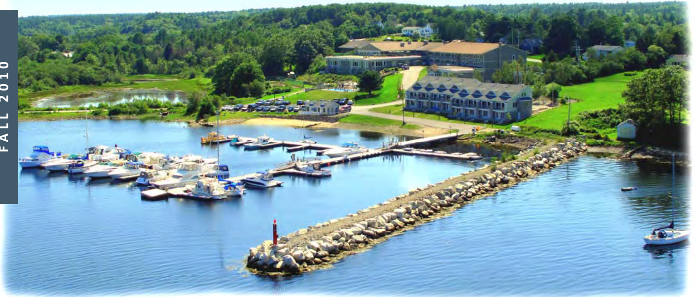
Atlantica Hotel & Marina Oak Island