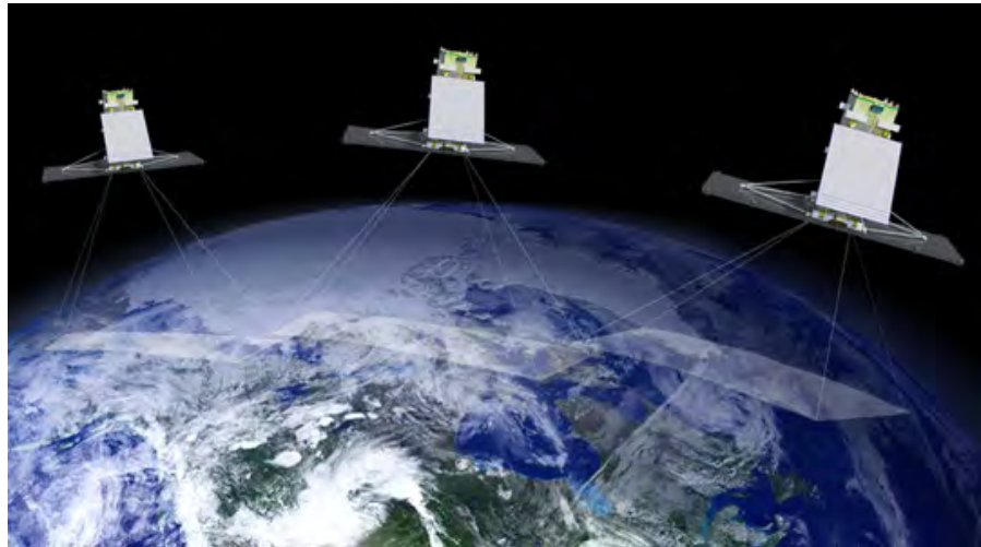
RADARSAT Constellation Depiction

IMP Avionics will be responsible to complete the design for the wire harness assemblies including material selection, process selection and development of test processes.