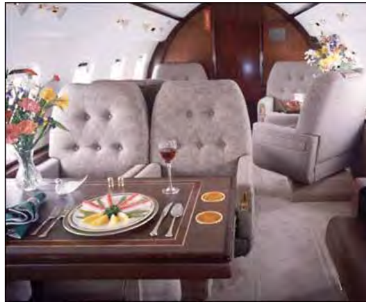
Inside a Challenger 601

several charters and expects other opportunities to arise in the coming weeks.