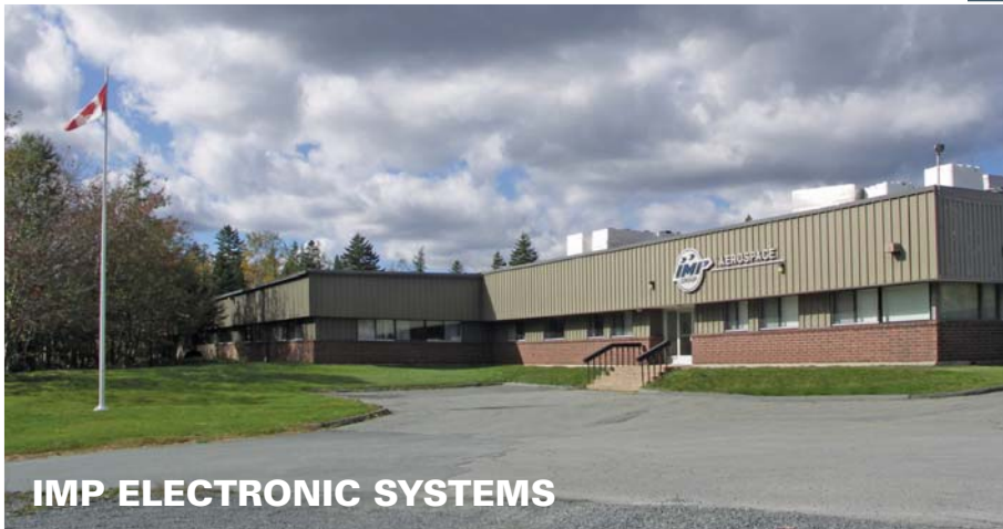
IMP ELECTRONIC SYSTEMS

IMP Aerospace & Defence is a business unit of IMP Group Ltd., a privately held, diversified group of Canadian companies with more than 4,400 employees worldwide. With business units in aerospace & defence, general aviation, airlines, information technologies, healthcare and properties, IMP Group Ltd., combines global reach with corporate strength and flexibility.